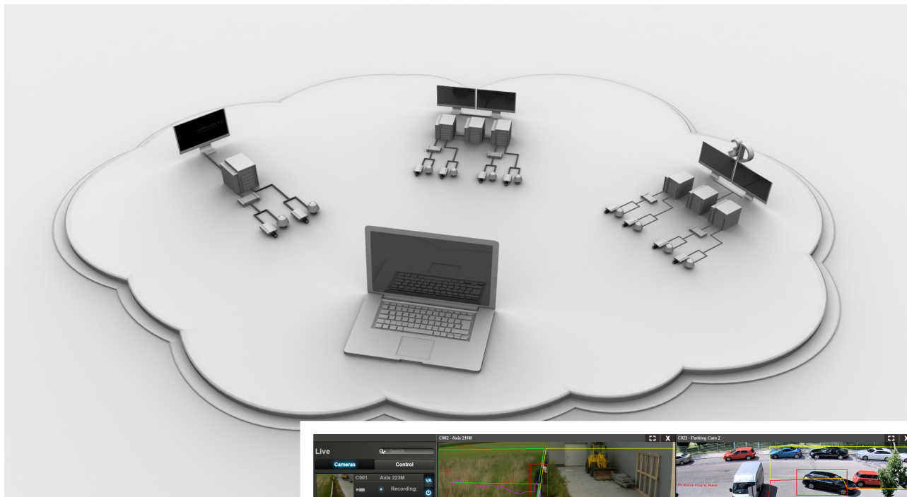
Above: Architecture for one or more, local video surveillance systems with WebClient.