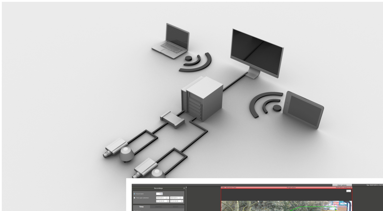
Above: Architecture for advanced, single or multi server video surveillance systems.