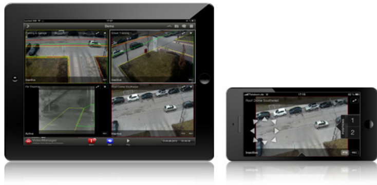
Right: Live page for monitoring (iPad) and control of PTZ cameras (iPhone).