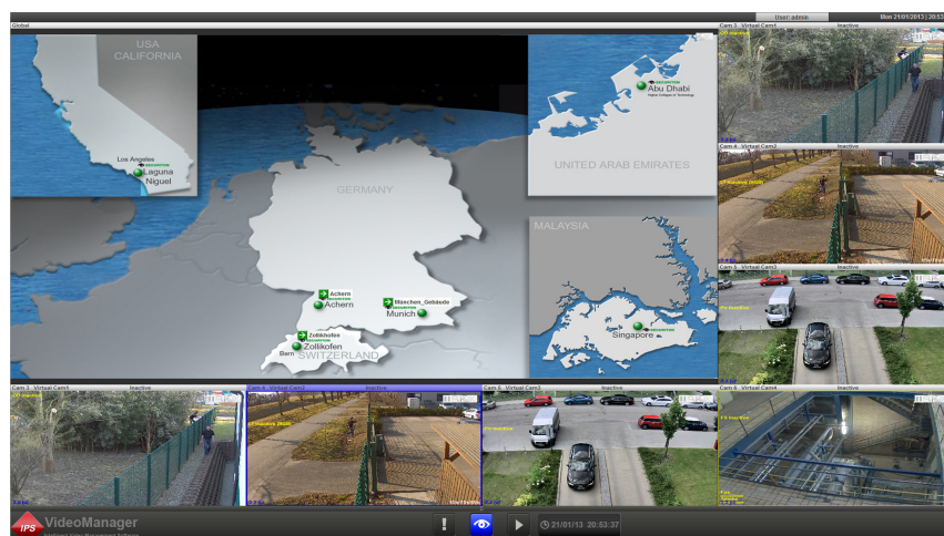
Right: Live page for display and easy navigation between different sites.