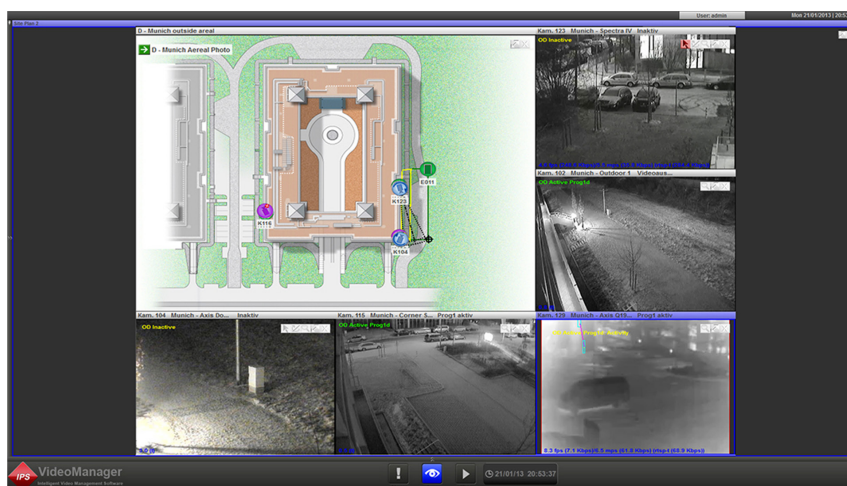
Right: Live page for easy display and control of cameras.